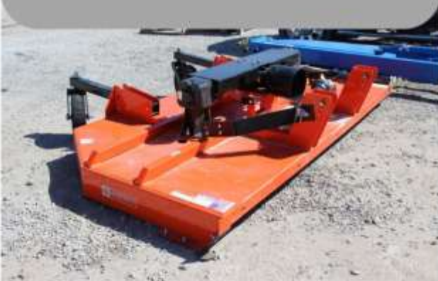
2023 Ironcraft 1810C Rotary Cutter $8,450