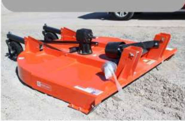
2023 Ironcraft 1507C Rotary Cutter $4,860