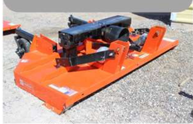
2023 Ironcraft 1808C Rotary Cutter $7,460