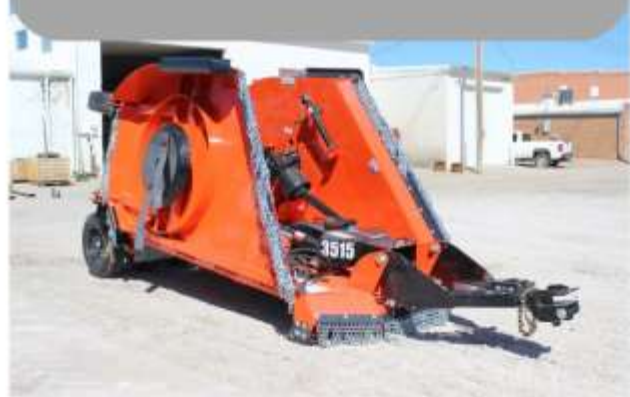
2023 Ironcraft 3515 Rotary Cutter $19,990

These units have rebates available to be used on any future purchase at Harchelroad Motors Ag, parts or wholegoods, must be used by December 31, 2023.