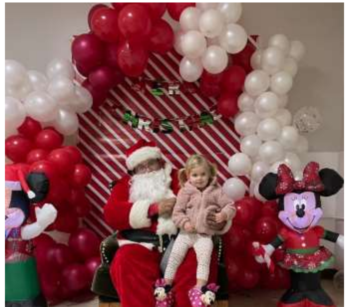
Santa visited with kids at the community building during the Chamber Soup and Dessert Supper.