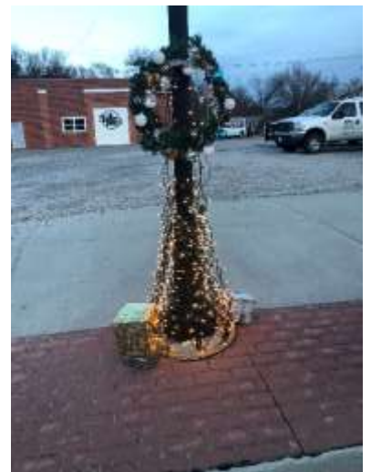
Winning light pole went to Wauneta Chateau Theatre.

Good crowd gathered at the Community Building for the Wauneta Chamber Soup and Dessert Supper. Proceeds went to the Chase County Pantry.