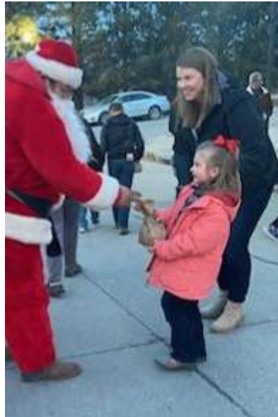
Santa Claus came to town on December 3 rd to visit the kids and delivered bags of candy.