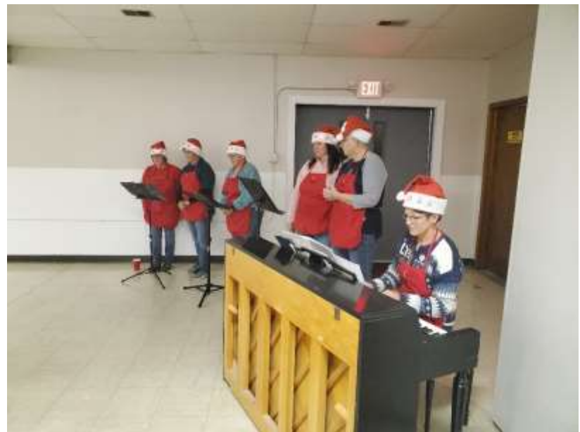
Methodist Women gave a rendition of the Church Basement Ladies at the Soup Supper.